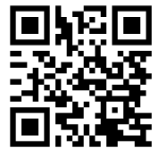
Class Website QR Code